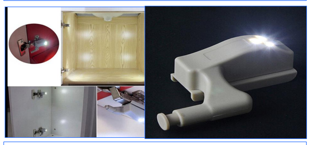
LED Energy Saving Products

Providing Solutions for LED, Solar Systems, Energy saving Fans, Security Solutions.t