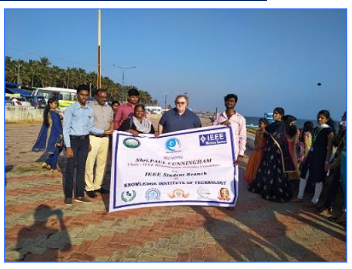
IEEE SIGHT Camp-2016