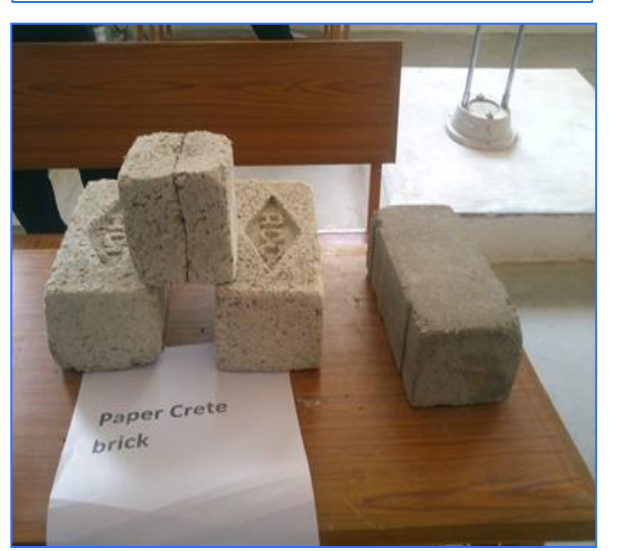
Paper Crete Brick