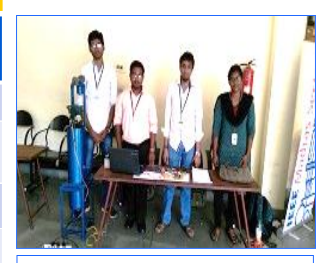
Life Protector Robot for Child in the Borehole