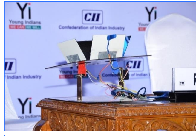
Quest Ingenium Contest Won 2nd Runner-up