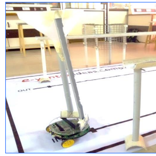
Poultry Farming Bot