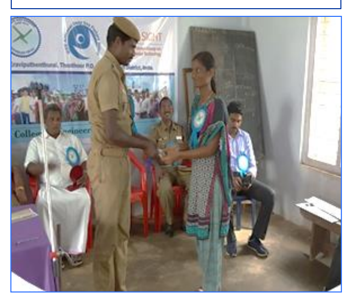
Received Best Female Leader during IEEE SIGHT