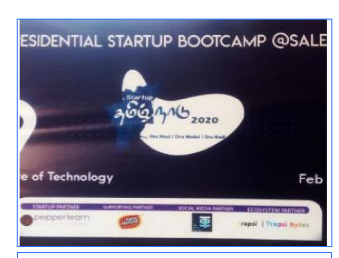
Ozhimayam Boot Camp (Startup)