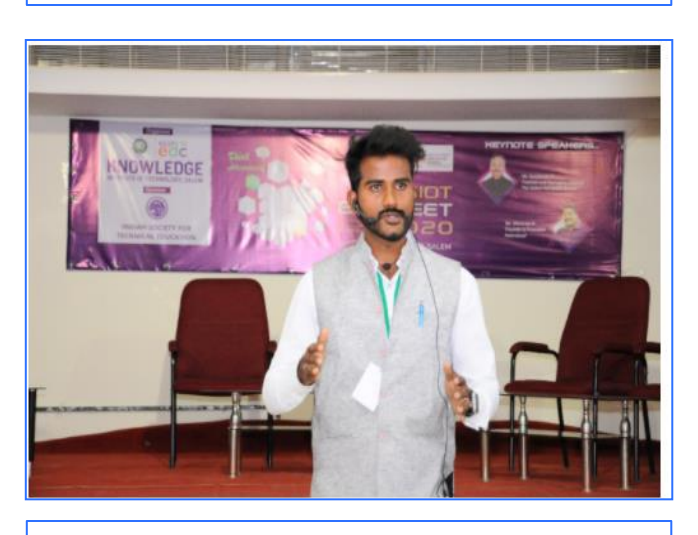
Entrepreneur Technopreneur Startupreneur Meet 2020